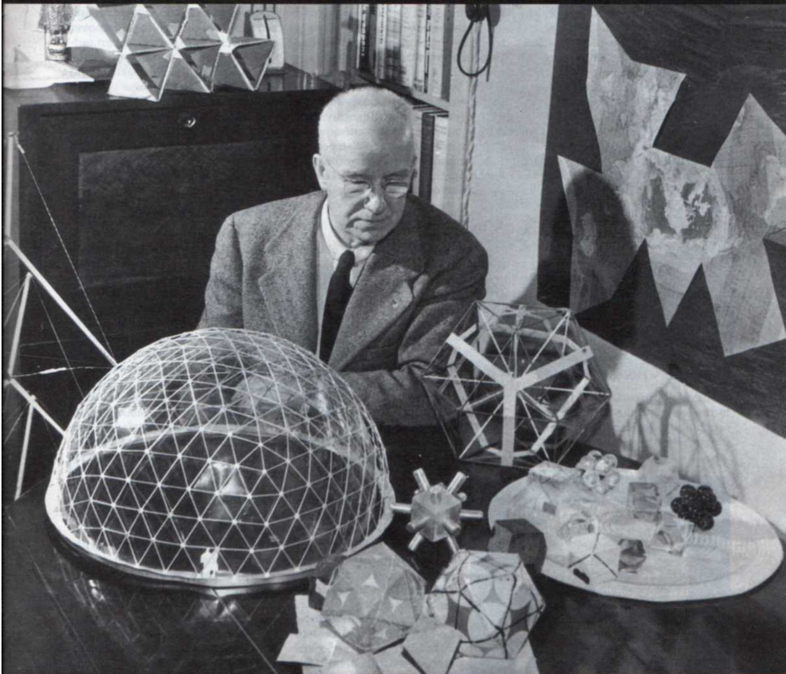
FROM THE DYMAXION WORLD OF BUCKMINSTER FULLER